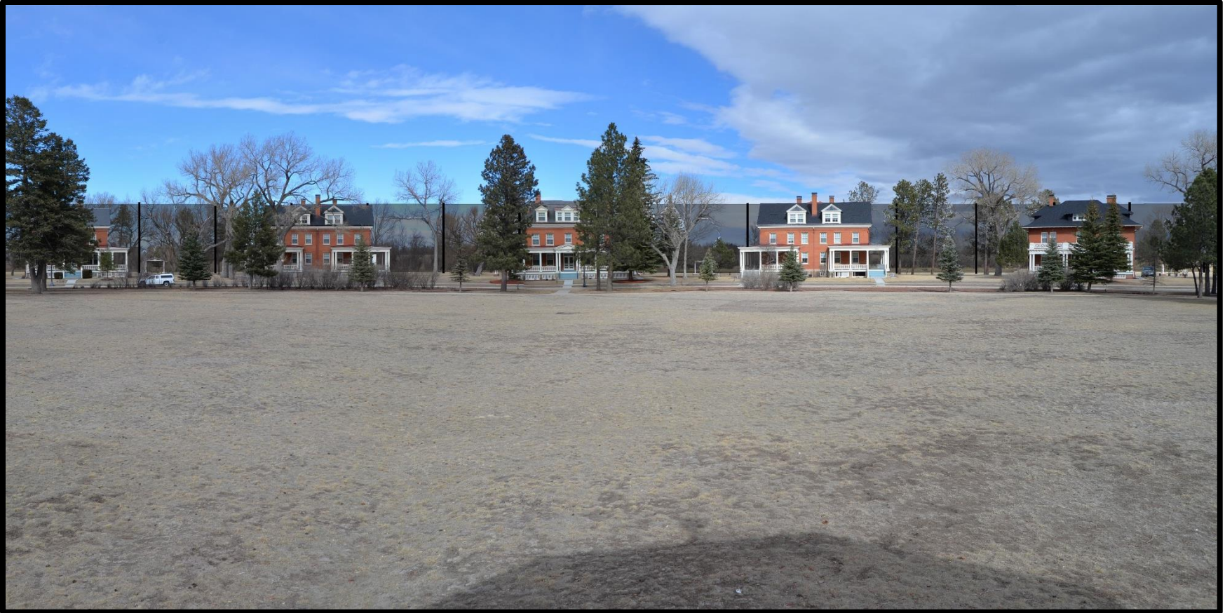
Figure 2: Simulation of the golf course net's visual impact on the Fort D. A. Russell NHL and National Register eligible buildings 114, 116, 117, 118, and 120.